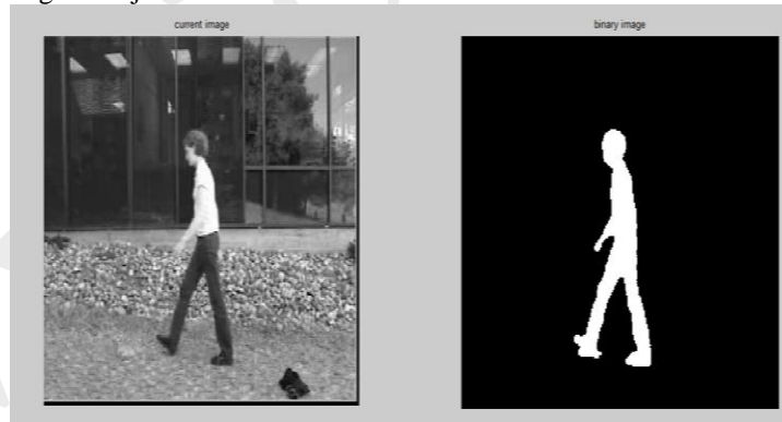
Fig. 3 Object detection

Morphology processing is the broad set of image processing operations that process the images based on the shapes. Morphological operations apply a structuring element to an input image, creating an output image of the same size. In the morphological operation, the value of each pixel in the output image is based on the comparison of the corresponding pixel in the input image with its neighbor. Morphological operations are applied on segmented binary image for smoothening the foreground region. It processes the image based on shapes and it performs on image using structuring element. The structuring elements will be created with specified shapes (disk, line, square) which contains 1's and 0's value where ones are represents the neighborhood pixels. Dilation and erosion process will be used to enhance (smoothening) the object region by removing the unwanted pixels from outside region of foreground object. After this process, the pixels are applied for connected component analysis and then analysis the object region for counting the objects