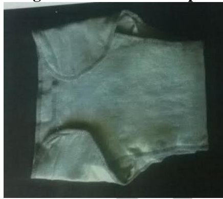
Fig. 3 Cotton Modal Diaper

Among all the cloth diapers, cotton modal diaper (Fig.3) ranks good in appearance, comfort, absorbency and softness.